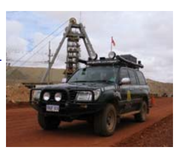
Who you gonna call?